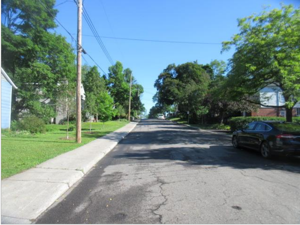
Surroundings – northwest direction