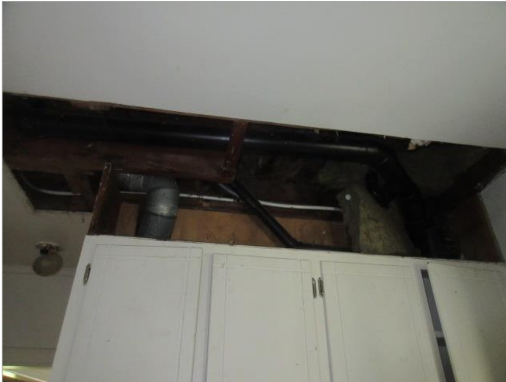
Ceiling – ground floor