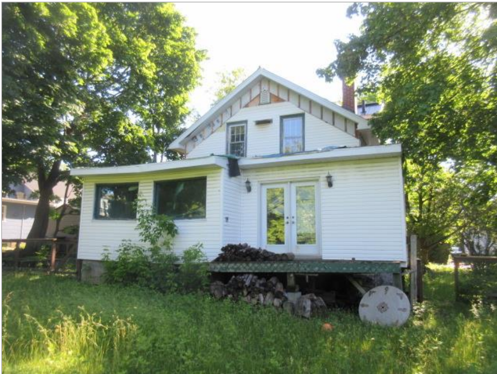
Rear side view of the building