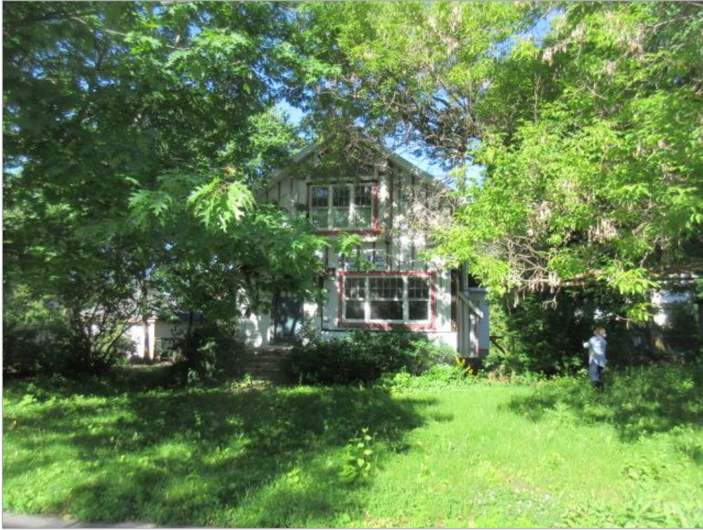
Front view of the building