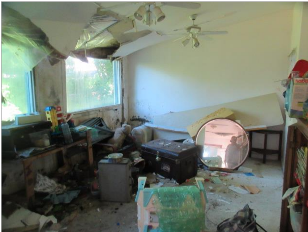
Family room on the ground floor