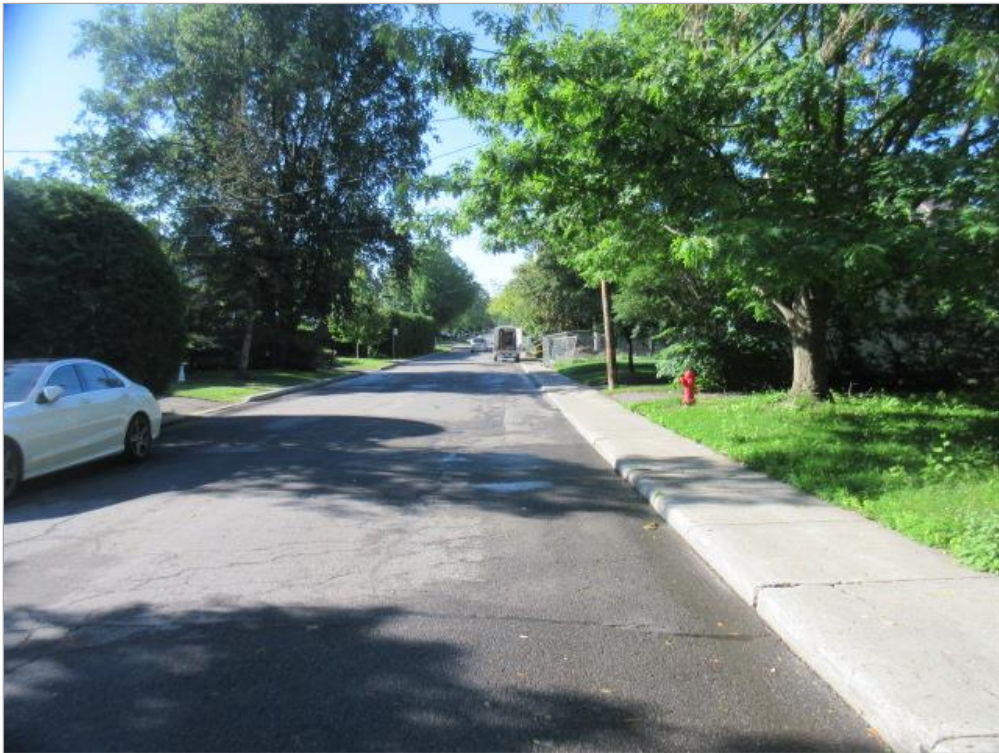
Surroundings – southwest direction