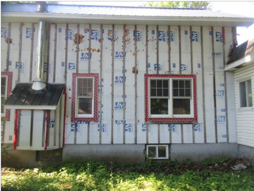
Rear view of the building