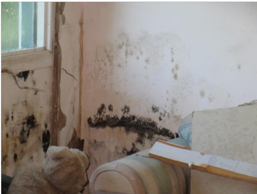
Mold on plaster